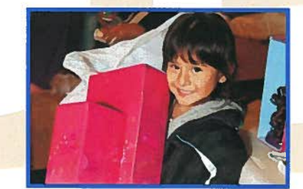
S. Mark Taper Foundation Shelter Resource Bank

The center, located in unincorporated Whittier, is owned and operated by the Community Development Commission of the County of Los Angeles, and recently provided 300 families with food and toys at its annual Holiday Basket Program.